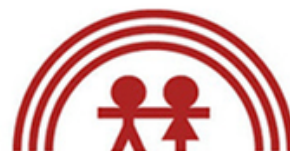
Danecourt School Partnership School